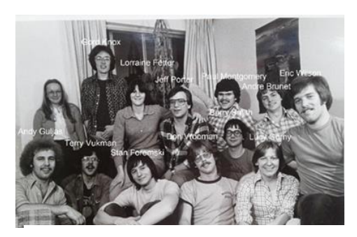
Computer Sciences Club 1978/79

Stay Connected: Update your contact info. Please send your email address updates to alumnirecords@uoguelph.ca